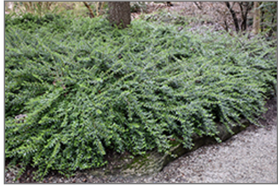
Privet Honeysuckle

This shrub does best in full sun to partial shade. It does best in average to evenly moist conditions, but will not tolerate standing water. It is not particular as to soil type or pH, and is able to handle environmental salt. It is highly tolerant of urban pollution and will even thrive in inner city environments. This species is not originally from North America.