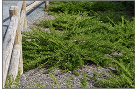
Privet Honeysuckle

Privet Honeysuckle is recommended for the following landscape applications;