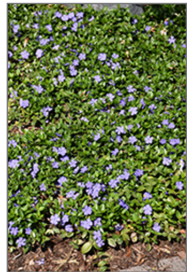
Dart's Blue Periwinkle in bloom