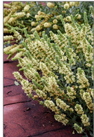
Ironwort flowers