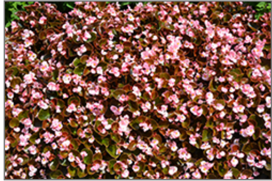
Cocktail Brandy Begonia flowers

Cocktail Brandy Begonia is a fine choice for the garden, but it is also a good selection for planting in outdoor containers and hanging baskets. It is often used as a 'filler' in the 'spiller-thriller-filler' container combination, providing a mass of flowers and foliage against which the thriller plants stand out. Note that when growing plants in outdoor containers and baskets, they may require more frequent waterings than they would in the yard or garden.