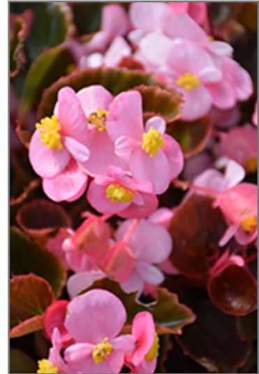
Cocktail Brandy Begonia flowers

This plant will require occasional maintenance and upkeep. Trim off the flower heads after they fade and die to encourage more blooms late into the season. Deer don't particularly care for this plant and will usually leave it alone in favor of tastier treats. Gardeners should be aware of the following characteristic(s) that may warrant special consideration;