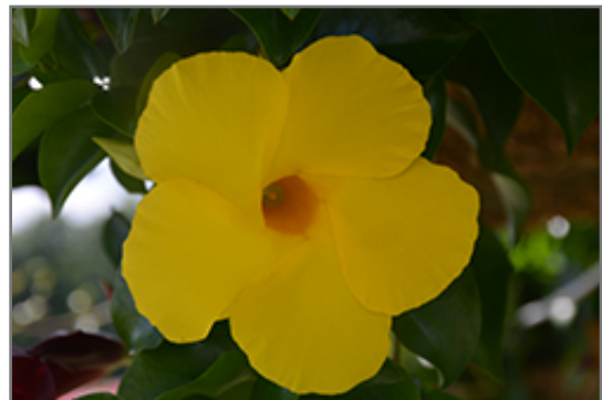
Diamantina Opal Yellow Mandevilla flowers