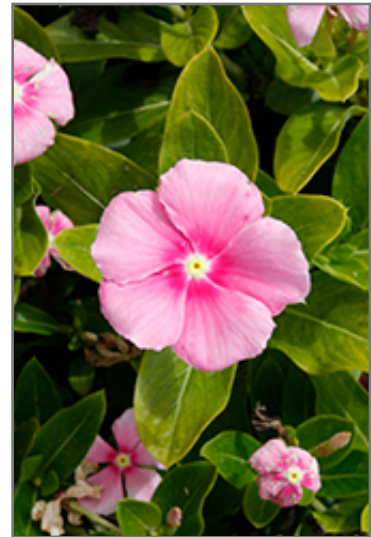
Cora Cascade Shell Pink Vinca flowers

Cora Cascade Shell Pink Vinca is recommended for the following landscape applications;