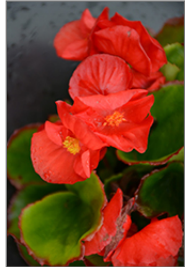
Sprint Plus Red Begonia flowers

This is a high maintenance plant that will require regular care and upkeep, and usually looks its best without pruning, although it will tolerate pruning. Deer don't particularly care for this plant and will usually leave it alone in favor of tastier treats. Gardeners should be aware of the following characteristic(s) that may warrant special consideration;