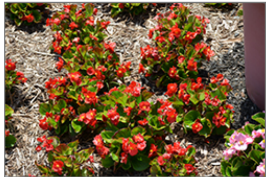
Sprint Plus Red Begonia in bloom