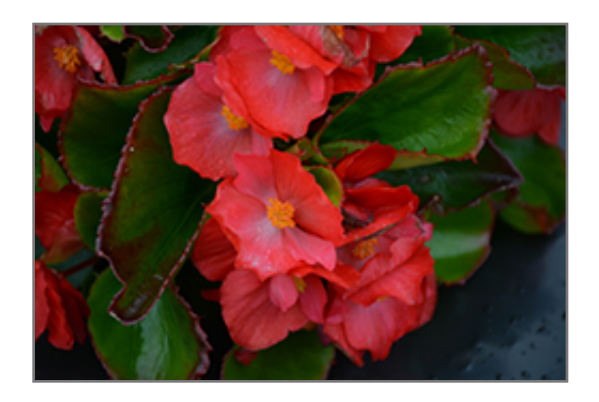
Sprint Plus Lipstick Begonia flowers

Sprint Plus Lipstick Begonia is recommended for the following landscape applications;