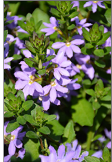
Scampi Blue Fan Flower flowers