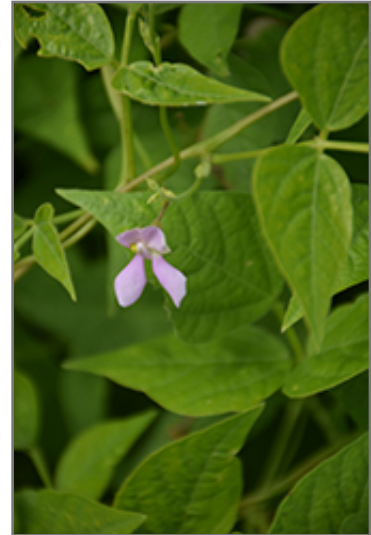
Golden Wax Bean flowers

Golden Wax Bean will grow to be about 10 feet tall at maturity, with a spread of 24 inches. When planted in rows, individual plants should be spaced approximately 12 inches apart. Because of its vigorous growth habit, it may require staking or supplemental support. This fast-growing vegetable plant is an annual, which means that it will grow for one season in your garden and then die after producing a crop. Because of its relatively short time to maturity, it lends itself to a series of successive plantings each staggered by a week or two; this will prolong the effective harvest period.