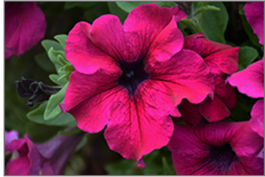
Sanguna Mega Purple Petunia flowers

This plant will require occasional maintenance and upkeep. Trim off the flower heads after they fade and die to encourage more blooms late into the season. It is a good choice for attracting butterflies and hummingbirds to your yard, but is not particularly attractive to deer who tend to leave it alone in favor of tastier treats. It has no significant negative characteristics.