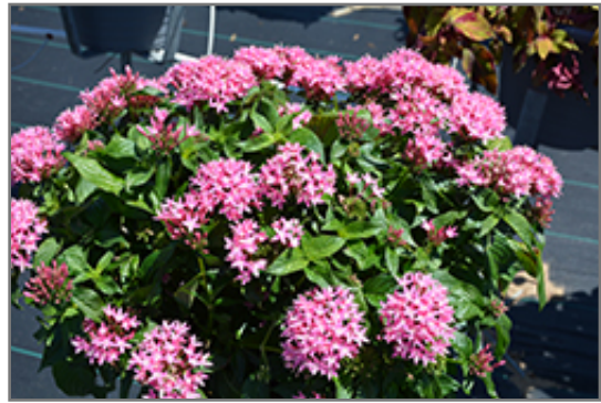
Lucky Star Deep Pink Star Flower in bloom

Lucky Star Deep Pink Star Flower is a fine choice for the garden, but it is also a good selection for planting in outdoor pots and containers. It is often used as a 'filler' in the 'spiller-thriller-filler' container combination, providing a mass of flowers against which the larger thriller plants stand out. Note that when growing plants in outdoor containers and baskets, they may require more frequent waterings than they would in the yard or garden.