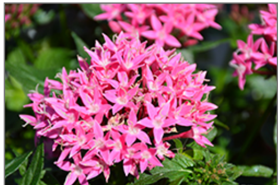
Lucky Star Deep Pink Star Flower flowers