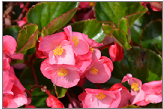
Viking Pink on Green Begonia flowers

Viking Pink on Green Begonia is recommended for the following landscape applications;