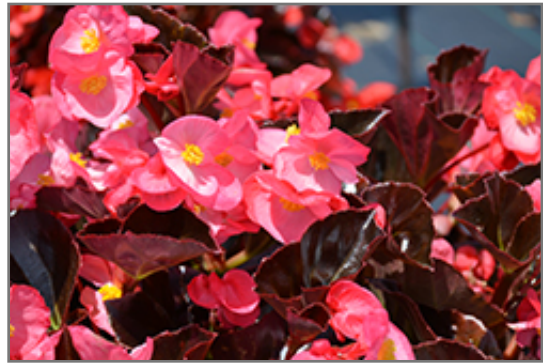
Viking Pink on Chocolate Begonia flowers

Viking Pink on Chocolate Begonia is recommended for the following landscape applications;