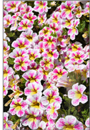
Superbells Holy Cow! Calibrachoa flowers

Superbells Holy Cow! Calibrachoa is a dense herbaceous annual with a trailing habit of growth, eventually spilling over the edges of hanging baskets and containers. Its medium texture blends into the garden, but can always be balanced by a couple of finer or coarser plants for an effective composition.