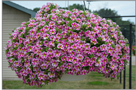
Superbells Holy Cow! Calibrachoa in bloom

Superbells Holy Cow! Calibrachoa is a fine choice for the garden, but it is also a good selection for planting in outdoor containers and hanging baskets. Because of its trailing habit of growth, it is ideally suited for use as a 'spiller' in the 'spiller-thriller-filler' container combination; plant it near the edges where it can spill gracefully over the pot. Note that when growing plants in outdoor containers and baskets, they may require more frequent waterings than they would in the yard or garden.