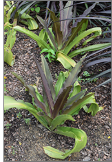
African Night Pineapple Lily

African Night Pineapple Lily is a fine choice for the garden, but it is also a good selection for planting in outdoor pots and containers. With its upright habit of growth, it is best suited for use as a 'thriller' in the 'spiller-thriller-filler' container combination; plant it near the center of the pot, surrounded by smaller plants and those that spill over the edges. It is even sizeable enough that it can be grown alone in a suitable container. Note that when growing plants in outdoor containers and baskets, they may require more frequent waterings than they would in the yard or garden.