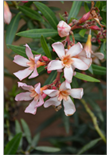
Sofia Oleander flowers

This plant does best in full sun to partial shade. It is very adaptable to both dry and moist locations, and should do just fine under typical garden conditions. It is considered to be drought-tolerant, and thus makes an ideal choice for a low-water garden or xeriscape application. It is not particular as to soil pH, but grows best in poor soils, and is able to handle environmental salt. It is highly tolerant of urban pollution and will even thrive in inner city environments. This particular variety is an interspecific hybrid, and parts of it are known to be toxic to humans and animals, so care should be exercised in planting it around children and pets.