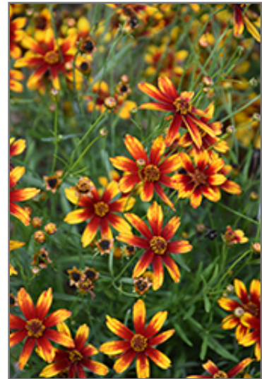
Satin & Lace Red Tapestry Tickseed flowers

Satin & Lace Red Tapestry Tickseed is recommended for the following landscape applications;