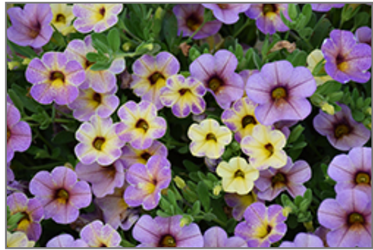
Chameleon Blueberry Scone Calibrachoa flowers

Chameleon Blueberry Scone Calibrachoa is a dense herbaceous annual with a trailing habit of growth, eventually spilling over the edges of hanging baskets and containers. Its medium texture blends into the garden, but can always be balanced by a couple of finer or coarser plants for an effective composition.