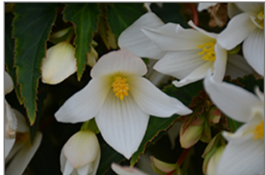
Beauvilia White Begonia flowers