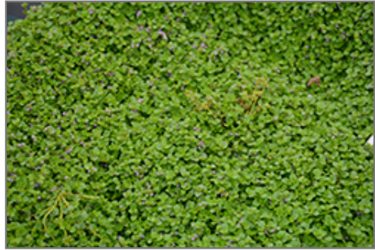
Mini Mint Ornamental Mint

Mini Mint Ornamental Mint is recommended for the following landscape applications;