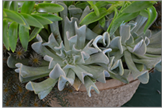
Topsy Turvy Echeveria

This is a dense herbaceous evergreen houseplant with tall flower stalks held atop a low mound of foliage. Its relatively fine texture sets it apart from other indoor plants with less refined foliage. This plant should not require much pruning, except when necessary to keep it looking its best.