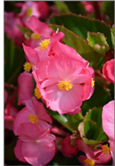
Big Pink Green Leaf Begonia flowers

This is a high maintenance plant that will require regular care and upkeep, and usually looks its best without pruning, although it will tolerate pruning. Deer don't particularly care for this plant and will usually leave it alone in favor of tastier treats. Gardeners should be aware of the following characteristic(s) that may warrant special consideration;