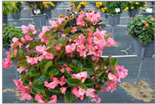
Big Pink Green Leaf Begonia in bloom

Big Pink Green Leaf Begonia is a fine choice for the garden, but it is also a good selection for planting in outdoor containers and hanging baskets. It is often used as a 'filler' in the 'spiller-thriller-filler' container combination, providing a mass of flowers and foliage against which the larger thriller plants stand out. Note that when growing plants in outdoor containers and baskets, they may require more frequent waterings than they would in the yard or garden.