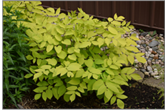
Sun King Japanese Spikenard