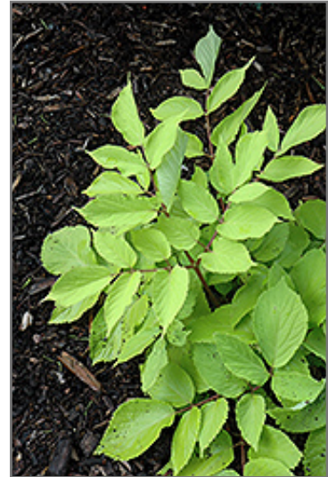
Sun King Japanese Spikenard foliage

This plant performs well in both full sun and full shade. It prefers to grow in average to moist conditions, and shouldn't be allowed to dry out. It is not particular as to soil type or pH. It is highly tolerant of urban pollution and will even thrive in inner city environments. This is a selected variety of a species not originally from North America.