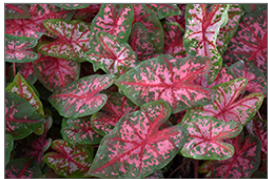
Carolyn Whorton Caladium foliage