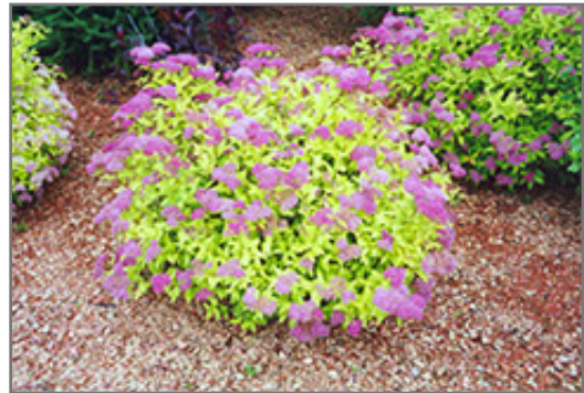
Goldmound Spirea in bloom

This shrub should only be grown in full sunlight. It prefers to grow in average to moist conditions, and shouldn't be allowed to dry out. It is not particular as to soil type or pH. It is highly tolerant of urban pollution and will even thrive in inner city environments. This is a selected variety of a species not originally from North America.