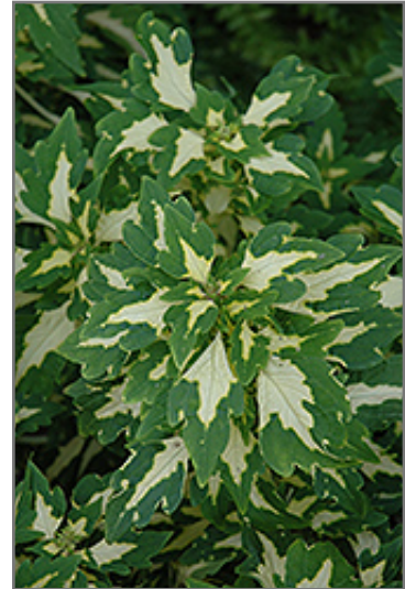
ColorBlaze Alligator Tears Coleus foliage