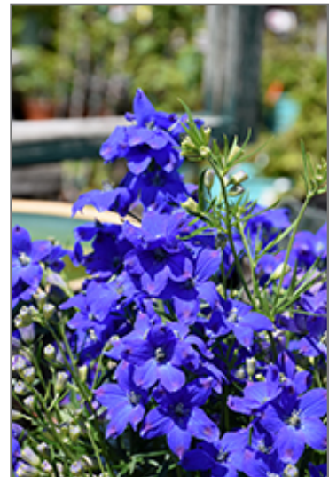
Diamonds Blue Delphinium flowers