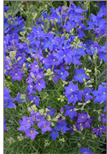
Diamonds Blue Delphinium flowers

Diamonds Blue Delphinium is recommended for the following landscape applications;