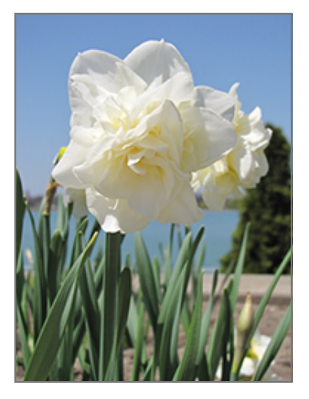
White Lion Daffodil flowers