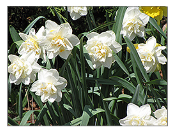
White Lion Daffodil flowers