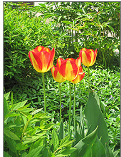
Antoinette Tulip in bloom