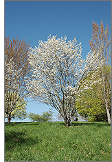
Princess Diana Serviceberry in bloom