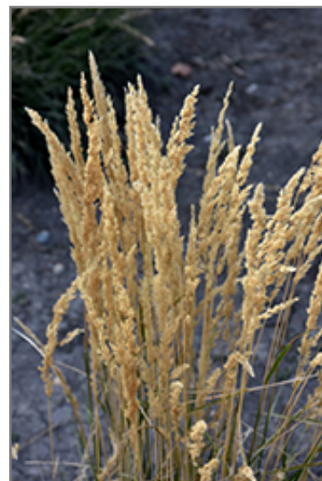
El Dorado Feather Reed Grass fruit

El Dorado Feather Reed Grass is a fine choice for the garden, but it is also a good selection for planting in outdoor pots and containers. Because of its height, it is often used as a 'thriller' in the 'spiller-thriller-filler' container combination; plant it near the center of the pot, surrounded by smaller plants and those that spill over the edges. It is even sizeable enough that it can be grown alone in a suitable container. Note that when growing plants in outdoor containers and baskets, they may require more frequent waterings than they would in the yard or garden.