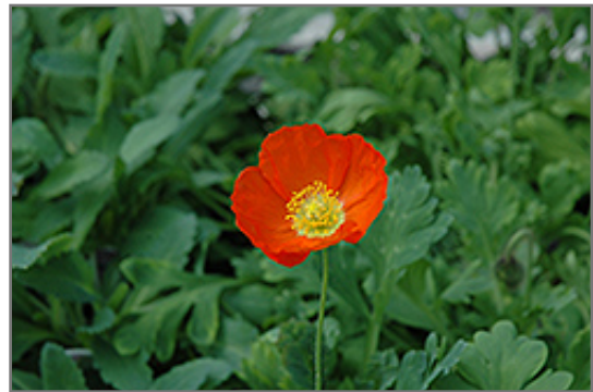
Champagne Bubbles Poppy flowers