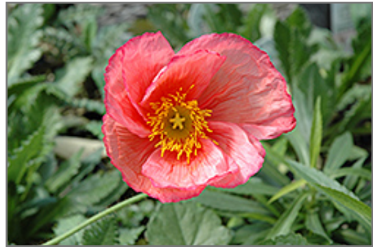
Champagne Bubbles Poppy flowers

Champagne Bubbles Poppy will grow to be only 6 inches tall at maturity extending to 18 inches tall with the flowers, with a spread of 18 inches. When grown in masses or used as a bedding plant, individual plants should be spaced approximately 14 inches apart. It grows at a fast rate, and under ideal conditions can be expected to live for approximately 3 years. As an herbaceous perennial, this plant will usually die back to the crown each winter, and will regrow from the base each spring. Be careful not to disturb the crown in late winter when it may not be readily seen! As this plant tends to go dormant in summer, it is best interplanted with late-season bloomers to hide the dying foliage.