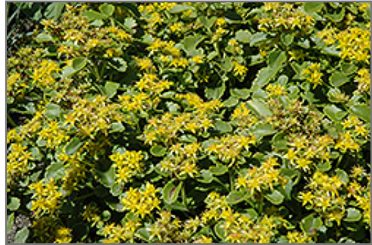
Golden Carpet Stonecrop flowers