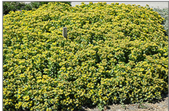
Golden Carpet Stonecrop in bloom