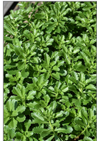
Japanese Stonecrop