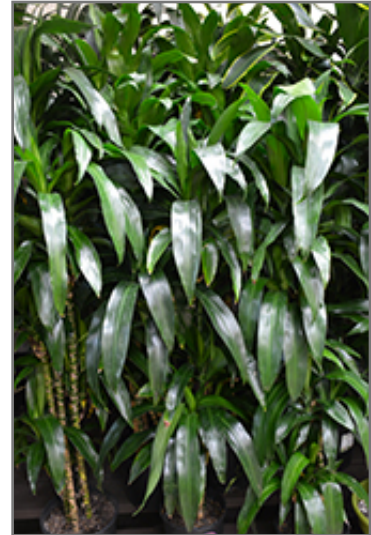
Lisa Dracaena foliage

When grown indoors, Lisa Dracaena can be expected to grow to be about 5 feet tall at maturity, with a spread of 24 inches. It grows at a medium rate, and under ideal conditions can be expected to live for approximately 10 years. This houseplant performs well in both bright or indirect sunlight and strong artificial light, and can therefore be situated in almost any well-lit room or location. It does best in average to evenly moist soil, but will not tolerate standing water. The surface of the soil shouldn't be allowed to dry out completely, and so you should expect to water this plant once and possibly even twice each week. Be aware that your particular watering schedule may vary depending on its location in the room, the pot size, plant size and other conditions; if in doubt, ask one of our experts in the store for advice. It will benefit from a regular feeding with a general-purpose fertilizer with every second or third watering. It is not particular as to soil type or pH; an average potting soil should work just fine.