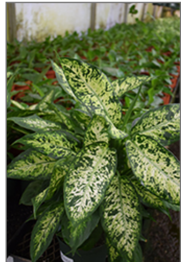
Compact Dieffenbachia in full