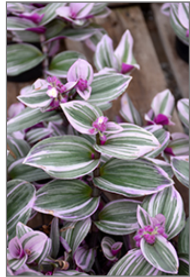
Nanouk Tradescantia foliage

This is an herbaceous evergreen houseplant with a spreading, ground-hugging habit of growth. Its relatively fine texture sets it apart from other indoor plants with less refined foliage. This plant may benefit from an occasional pruning to look its best.