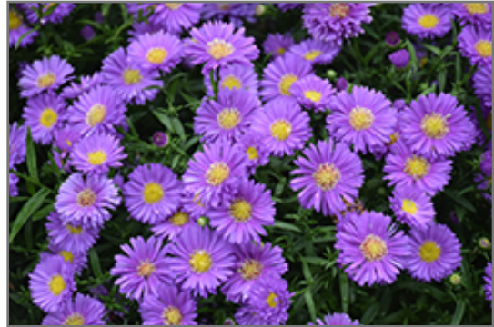
Magic Purple Aster flowers

Magic Purple Aster is recommended for the following landscape applications;