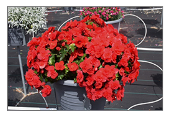
Bonny Begonia in bloom