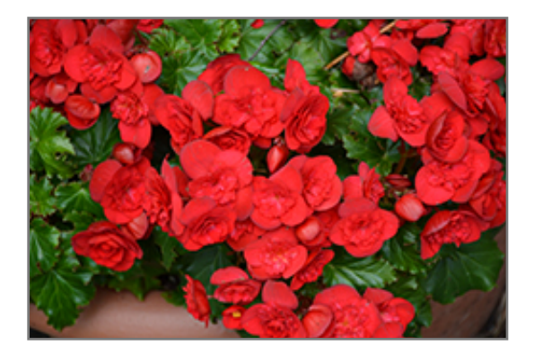
Bonny Begonia flowers

Bonny Begonia is recommended for the following landscape applications;