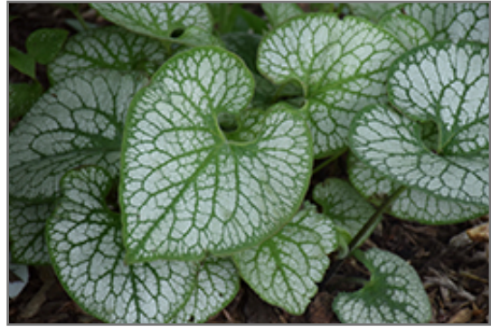
Jack Frost Bugloss foliage

Jack Frost Bugloss is recommended for the following landscape applications;