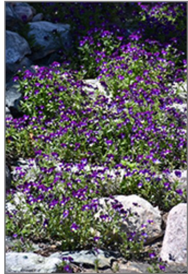
Johnny Jump-Up in bloom