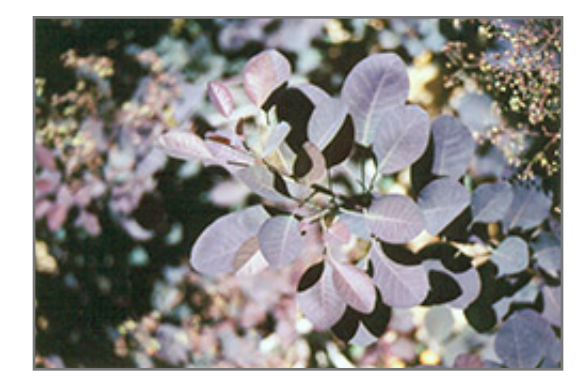
Purple Smokebush foliage

Purple Smokebush is recommended for the following landscape applications;