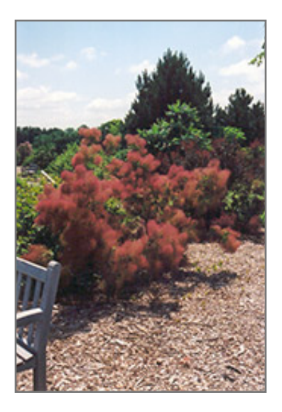
Purple Smokebush in bloom