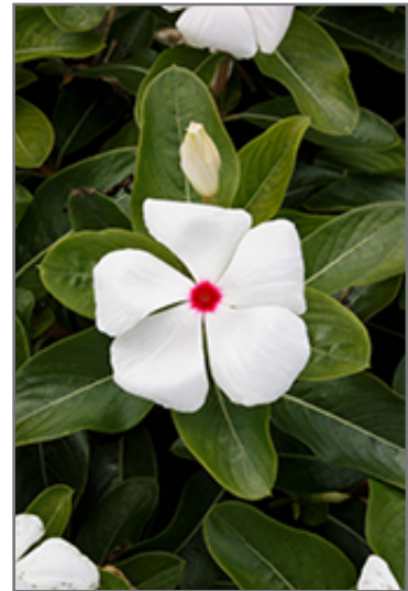
Cora Cascade Polka Dot Vinca flowers

Cora Cascade Polka Dot Vinca is recommended for the following landscape applications;