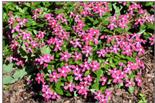
Soiree Kawaii Red Vinca in bloom