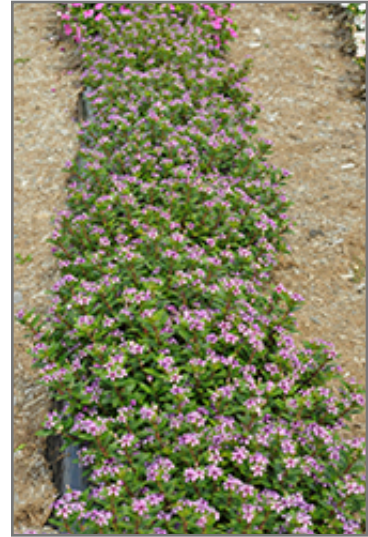
Soiree Kawaii Blueberry Kiss Vinca in bloom

Soiree Kawaii Blueberry Kiss Vinca is a fine choice for the garden, but it is also a good selection for planting in outdoor containers and hanging baskets. Because of its trailing habit of growth, it is ideally suited for use as a 'spiller' in the 'spiller-thriller-filler' container combination; plant it near the edges where it can spill gracefully over the pot. Note that when growing plants in outdoor containers and baskets, they may require more frequent waterings than they would in the yard or garden.