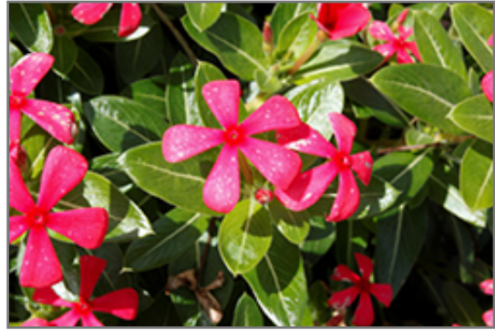
Soiree Kawaii Red Shades Vinca flowers

Soiree Kawaii Red Shades Vinca is a dense herbaceous annual with a trailing habit of growth, eventually spilling over the edges of hanging baskets and containers. Its medium texture blends into the garden, but can always be balanced by a couple of finer or coarser plants for an effective composition.