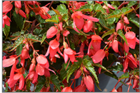
Groovy Rose Begonia flowers