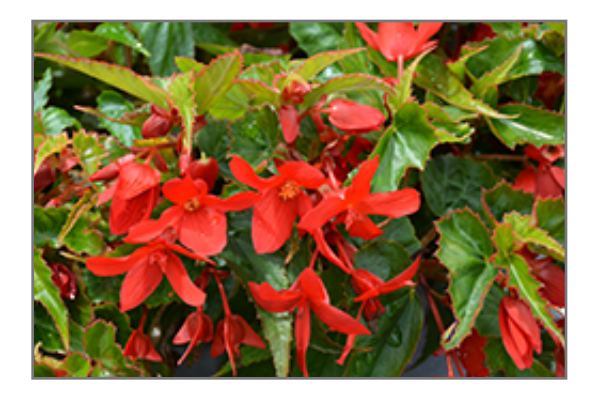
Groovy Red Begonia flowers

Groovy Red Begonia is recommended for the following landscape applications;