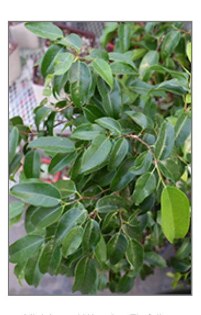
Mini Amstel Weeping Fig foliage

When grown indoors, Mini Amstel Weeping Fig can be expected to grow to be about 4 feet tall at maturity, with a spread of 24 inches. It grows at a medium rate, and under ideal conditions can be expected to live for approximately 50 years. This houseplant will do well in a location that gets either direct or indirect sunlight, although it will usually require a more brightly-lit environment than what artificial indoor lighting alone can provide. It does best in average to evenly moist soil, but will not tolerate standing water. The surface of the soil shouldn't be allowed to dry out completely, and so you should expect to water this plant once and possibly even twice each week. Be aware that your particular watering schedule may vary depending on its location in the room, the pot size, plant size and other conditions; if in doubt, ask one of our experts in the store for advice. It is not particular as to soil type or pH; an average potting soil should work just fine.